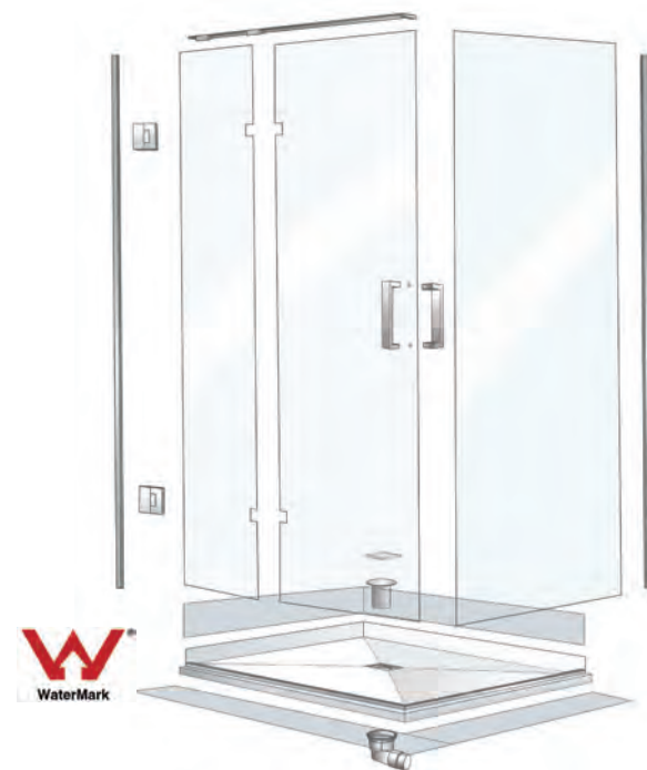
Illustration of 2-walled shower showing hinged door.